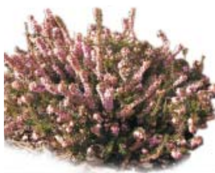
Erica \times darleyensis 'Irish Treasure'