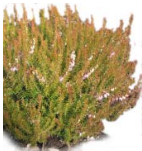
Erica \times darleyensis 'Goldrush'

Erica \times darleyensis 'Goldrush' . 'Goldrush' was selected from seedlings resulting from David Wilson's deliberate cross between E. carnea 'Golden Starlet' and E. erigena 'Brian Proudley'. This cross was made in 1995, and a number of promising seedlings were planted in the garden three years later. Plants were retained that displayed a more yellow-gold foliage than other existing cultivars. This feature is especially important in the Pacific Northwest, helping to brighten our gray winter months. In milder climates, where using planters and hanging baskets for winter decoration is very popular, the foliage of 'Goldrush' can be used to show off the many interesting winter plants we use in containers. It will contrast well with dark-foliaged perennials, purple kale, winter pansies and berried plants like wintergreen and lingonberry.