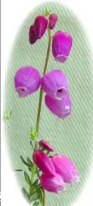
Erica × scotica 'Ellen Norris'